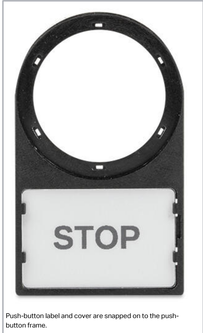
Push-button label and cover are snapped on to the push-button frame.